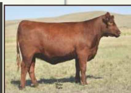
WR MS CITA 1D · Reg. #3616458