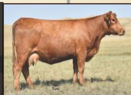
WR MS ARY 2269 · Reg. #1604855