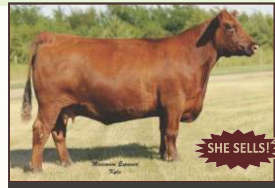
GT CITA 4060 · Reg. #1060202

Selling all Registered Red Angus Females in the Fall Red Dirt Roundup.