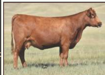
WR MS FORTUNE 2277 · Reg. #1602515