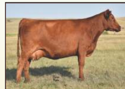
WR MS LIGHTING 3069 · Reg. #1658807