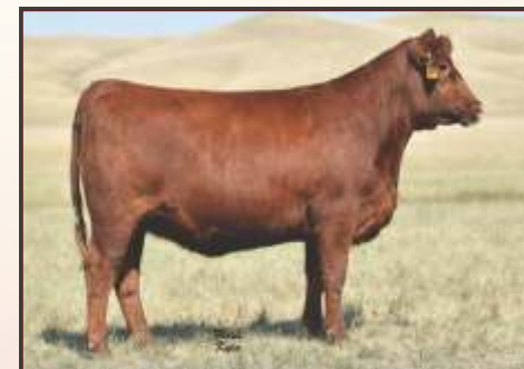
WR MS CITA 2D · Reg. #3616460