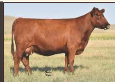
WR MS SIBLING RIVALRY 90 · Reg. #1304578