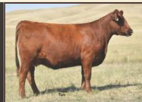
ULRA BARONESS 1514 · Reg. #3481825