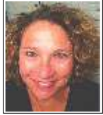
By: Gina Stanley

Man. It's been a rough couple of months! In this little space, I have shared lots of stories of frustration